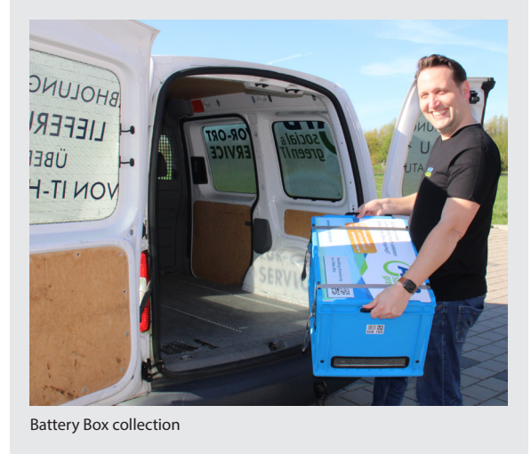
Battery Box collection